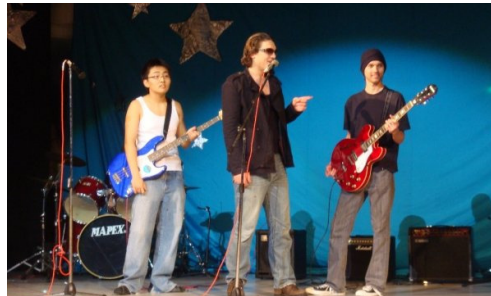
U2 wait to here the judges' views